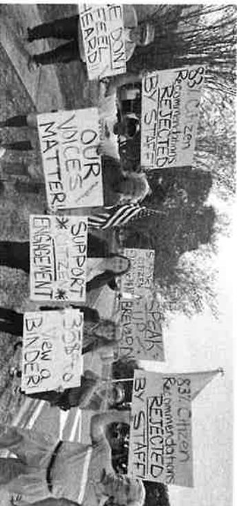
The County Manager's Office has 90 days to evaluate and comment on the recommendation, and then forward it to the Board of County Commissioners for their review. The Board of County Commissioners must make a final vote to either approve, reject, or revise and accept the recommendation within 120 days. The sponsor of the recommendation will be given at least a week's notice prior to a being reinvited or by the Board.