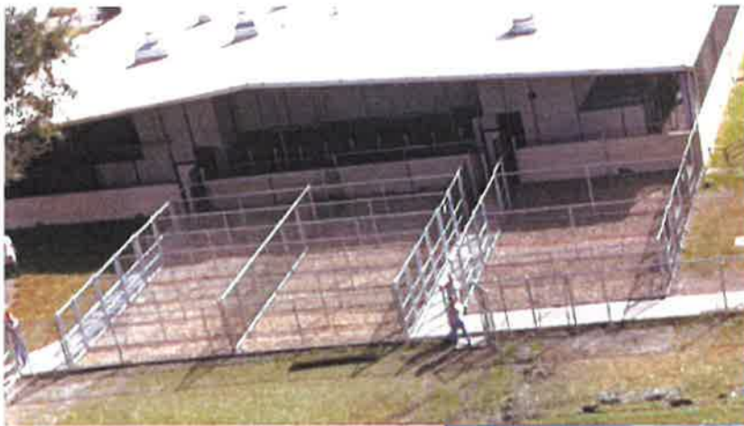
and After Renovation.