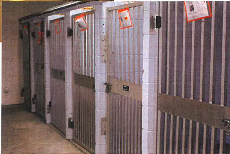
and After Renovation.