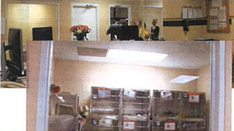
Cat Area Before & After Renovation