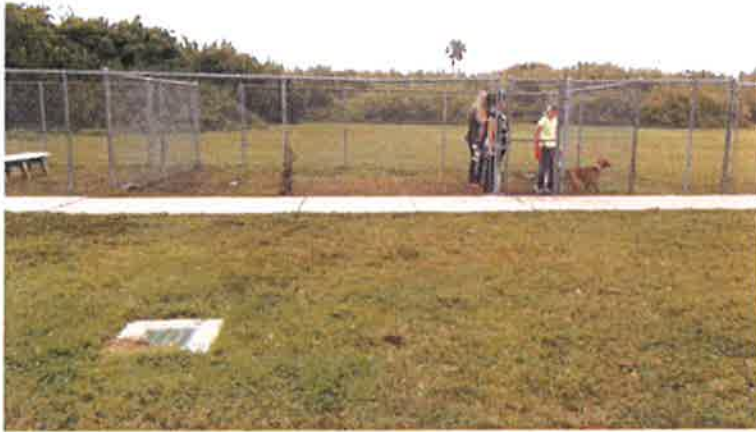
Outdoor Kennels Before...