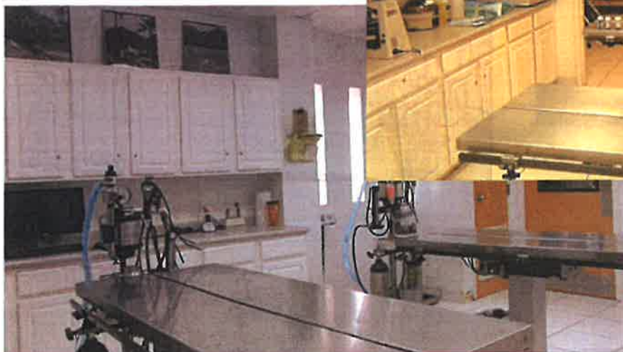
and After Renovation.