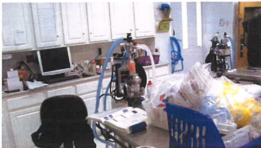
Vet Area Before...