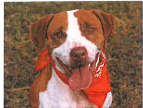
Like Comment Share