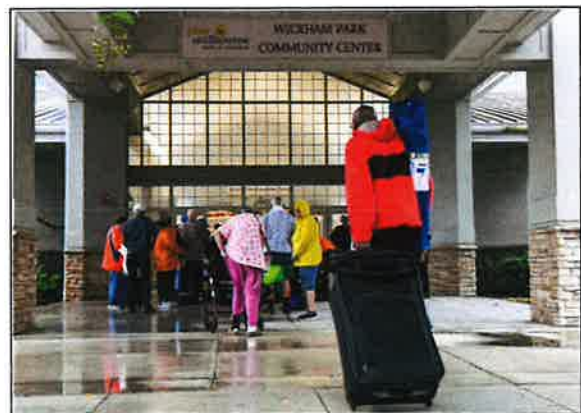
Hurricane Milton Shelter at Wickham Park Community Center