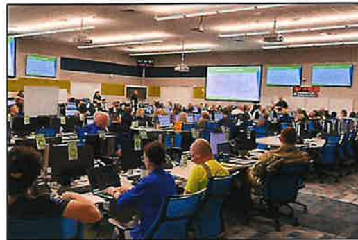
Brevard County Emergency Operations Center, 2025 Hurricane Exercise

Together, planning, training, and exercises build the coordination, confidence, and readiness to ensure all partners can respond to and recover from disasters effectively.