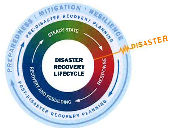
FEMA National Disaster Recovery Framework, 2024