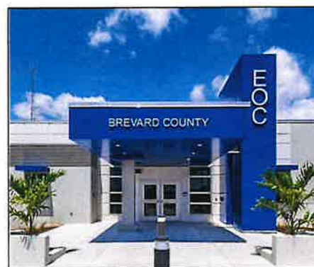
Brevard County Emergency Operations Center, 2025

The primary function of the EOC is to facilitate the collection, verification, and distribution of information, resource allocation, facilitation of interagency communication, and support for disaster operations. The EOC also provides strategic oversight, ensuring compliance with emergency management plans, and coordinating public information dissemination.