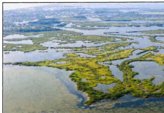
St. Johns River Water Management District, 2025

Brevard County spans 72 miles along Florida's east coast and is home to diverse communities, vital natural resources, and industry leaders for space and defense operations. The County's eastern border is defined by the Atlantic Coastal Ridge, with naturally elevated dunes that help buffer inland areas from storm surge. The western border is marked by the St. Johns River Valley, Florida's longest river and one of the few in the United States that flows north. The Indian River Lagoon makes up the heart of the county, a 156-mile-long estuary that includes the Banana River, Indian River, and Mosquito Lagoon. It is among the most biologically diverse in North America and serves as a vital ecological asset for the region.