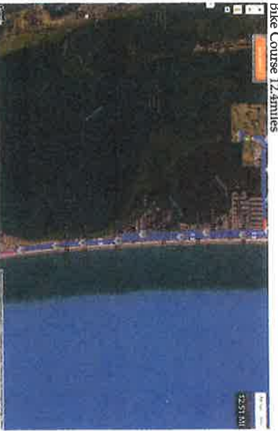
Bike Course 12.4miles

Bike: out and back course on state road A1A with lane completely closed to traffic.