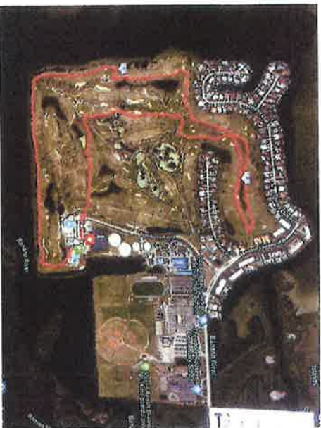
Rm Course 3.1miles

Run is on a completely closed GOLF COURSE with NO intersections or vehicle interaction.