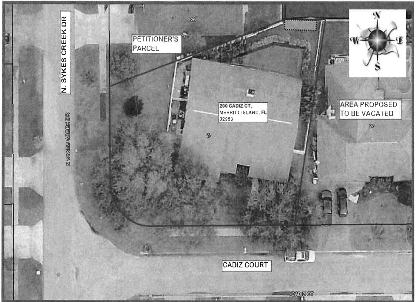
Fig. 3: Map of aerial view of Lot 27, Block G, Villa De Palmas Unit No. 4, 200 Cadiz Court, Merritt Island, FL 32953

Jared F. & Susanne H. Maher – Lot 27, Block G, “Villa De Palmas Unit No. 4” (Plat Book 25, Page 120) – 200 Cadiz Court – Section 14, Township 24 South, Range 36 East – District 2 – Proposed Vacating of a 5.0 ft. Wide Public Utility & Drainage Easement along the rear line.