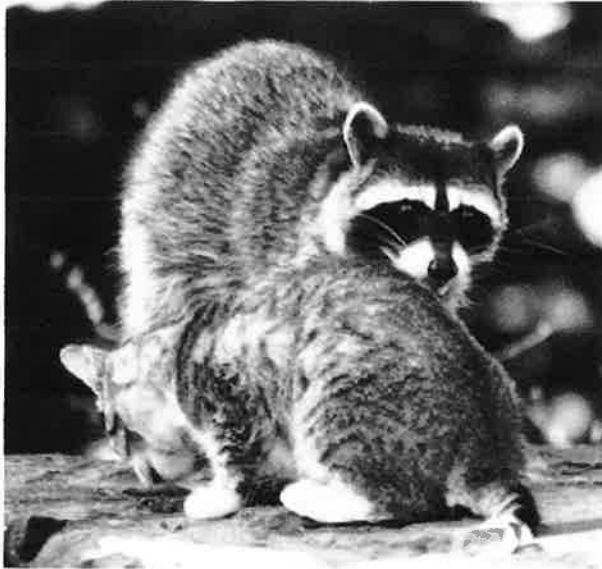
Fig. 1. Potential interaction between a cat and raccoon.

2008a). Cross-species contact also allows feral cat populations to spread diseases to wildlife. In one study, about a third of raccoons and opossums sharing habitats with feral cats showed evidence of past infection with Toxoplasma gondii , a deadly zoonosis that requires felids to complete its life cycle (Fredebaugh et al., 2011).