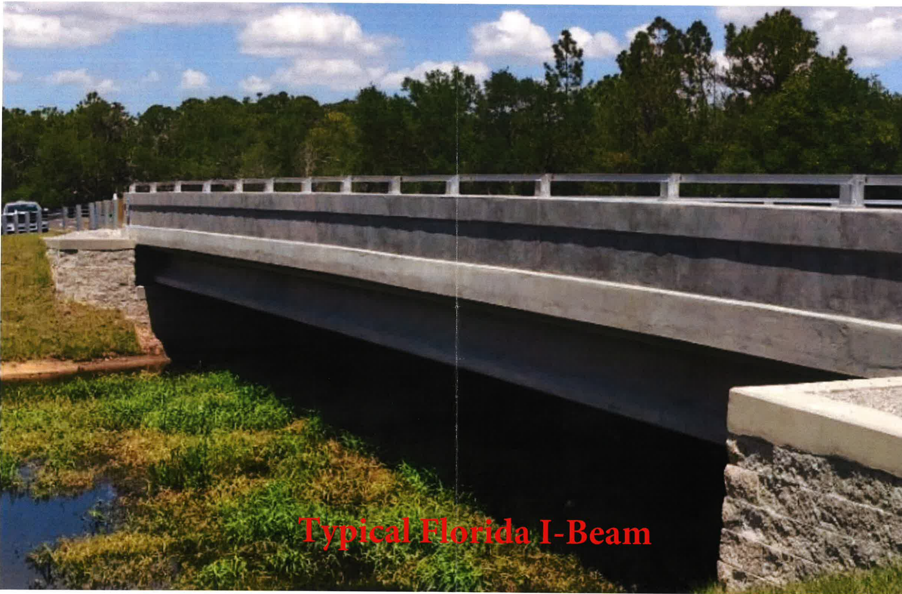
Typical Florida I-Beam