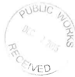
EXHIBIT "A" ADDITIONAL SCOPE OF SERVICES FOR SUPPLEMENTAL AMENDMENT NUMBER 1

Financial Management Number: 431923-1-38-01